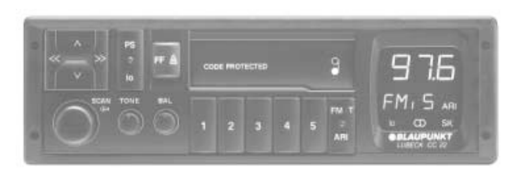
Lübeck CC 22