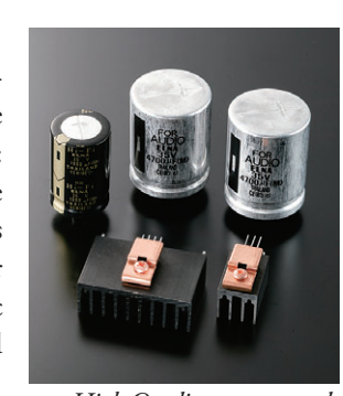
High Quality power supply component

A solid chassis, additional button plate and shock-absorbing feet are just some examples of the attention to detail you will enjoy with the SA-15S1. For the best contact solid RCA terminals are built in and have been mounted on a zero impedance matching point. The customized components are symmetrically arranged, and all parts of the system work in perfect harmony. All of which enables the SA-15S1 SA-CD player to faithfully reproduce even the most complex musical compositions in your collection.