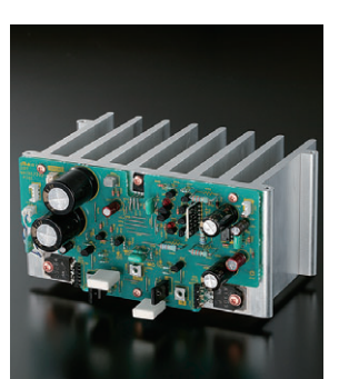
Current Feedback Power amp