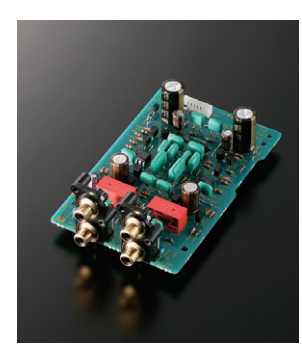
Current Feedback MM/MC Phono stage