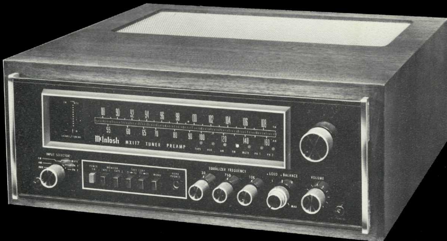
MX 117 The McIntosh MX 117 is shown in optional walnut veneer cabinet.

The MX 117 AM-FM Stereo Tuner-Preamplifier concept is a total McIntosh master control center that allows you to select the matching McIntosh power amplifier for your individual requirements. All needed inputs such as two record players, two tape recorders and auxiliary can be accommodated, along with the built-in AM-FM stereo tuner. The advanced circuits and performance features of the McIntosh MX 117 make it an ideal and especially convenient solution for the most discriminating stereo listener.