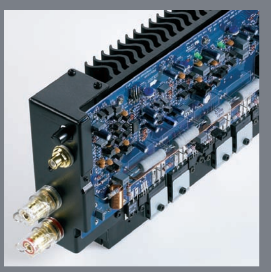
Each of the M25's seven channels is contained in a 'monoblock' gain module. So you benefit with the lowest distortion and widest channel separation. Effortless power adds emotional impact to your films.

The remote with brains and beauty. Control your Home Theatre with an ergonomic form that melts into your hand. Soft illumination guides your finger to the correct key – even in theatrical lighting conditions.