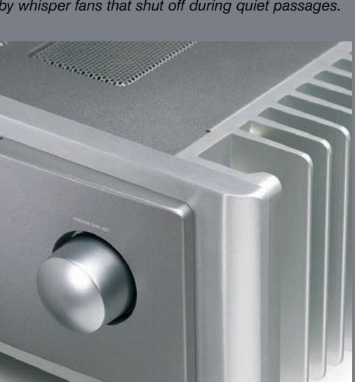
You gain the advantage of the most detail-oriented NAD engineering – ever. Convenient handles are part of the massive heat sink assembly designed specifically for the M3.