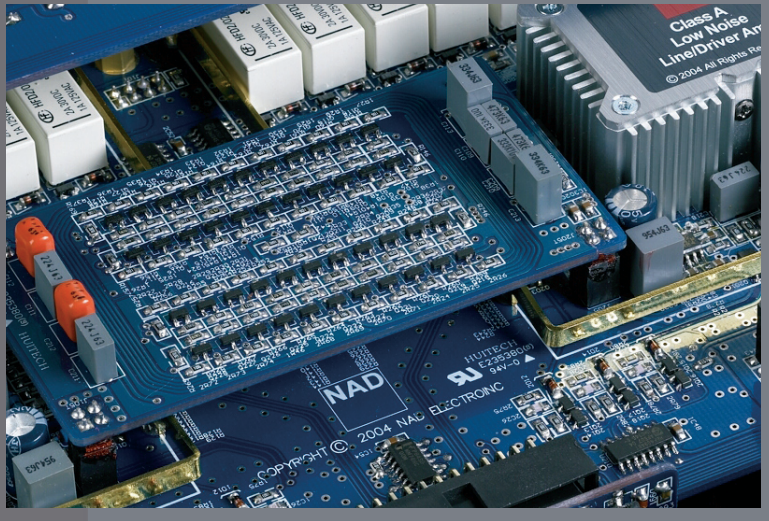
NAD's proprietary multi-stage discreet volume control circuit provides precise volume settings in 0.5dB increments with ultra high signal-to-noise ratio. Special NAD Class A gain modules provide tremendous dynamic headroom and nearly immeasurable distortion.