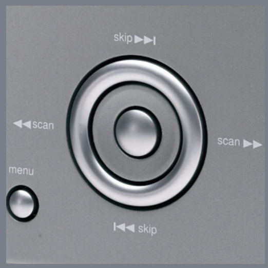
Studio grade audio and video performance. Premium parts, extensive shielding, and advanced circuitry provide it. You enjoy precise decoding for an improved music and movie experience.