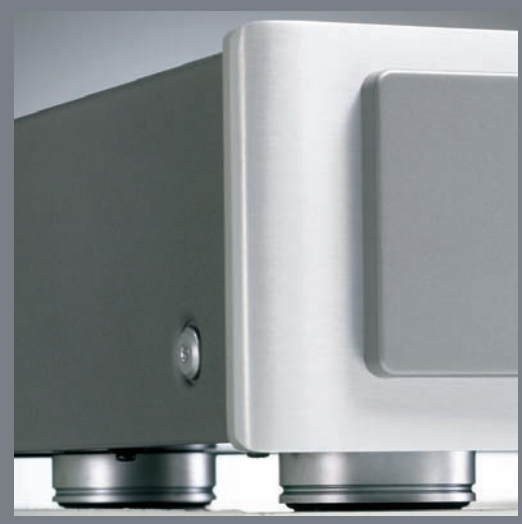
A unique vibration damping foot comprised of a cast aluminum support with a highly absorbent silicon rubber insert. Combined with the rugged steel chassis you benefit with superb isolation for purer sound.