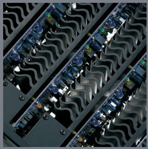
Unique NAD engineering. A 'wave form' heat sink fits 34% more cooling capacity into the same area as traditional designs. Greater thermal efficiency is aided by whisper fans that shut off during quiet passages.