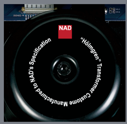
An NAD first. "Holmgren" custom-made transformers use special steel cores and winding techniques for excellent mains regulation and dynamic performance.

Here you see the hardware that gives the Masters Series its exceptional brio – to use a musical expression. Evolved internal construction, free-reign engineering – that's how to raise the bar on performance. That's your gain.