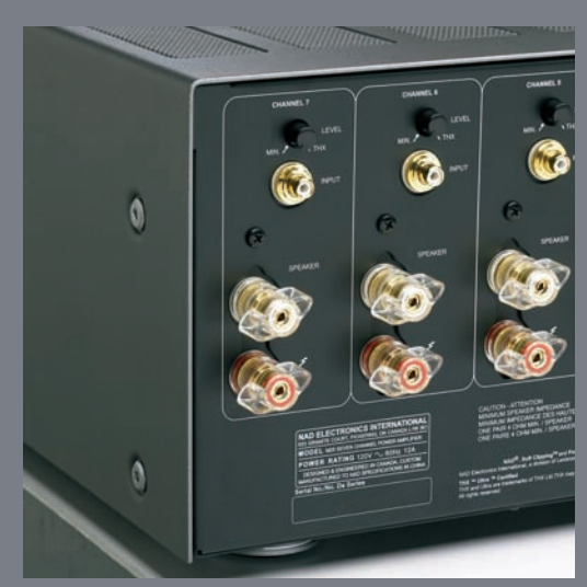
Your speaker connections are optimized with unique custom binding posts. You benefit with special gold-plated conductors and clear acrylic twist wings for installation ease and a tight corrosion-free connection.