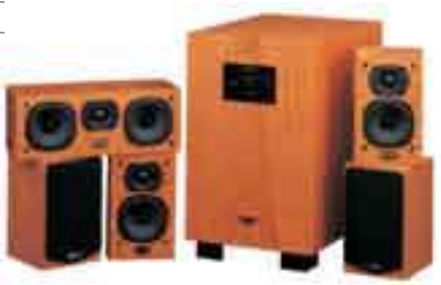
L2 Series Surround Package