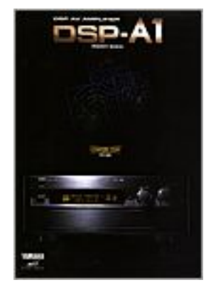
Catalog of that time

Because now, as for the DVD player who does not have the logograph of DTS it is the extent which is not sold, don't you think? truly oh with while saying, it is the spread red sandal wood.