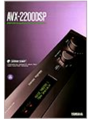
Catalog of that time

Don't you think? that time it is increasing to about 25 ten thousand Yen it is. So, reputation was not bad. At that time, you looked at the movie in the clean picture, it was if, only bought the laser disk. Furthermore so, this (AVX-2200DSP) as for the customer who is bought, generally similar the customer probably will be many, that. If in the laser disk 25 ten thousand Yen the customer who is put out, 22 ten thousand Yen it puts out to AV center, whether it is it is not, that (laughing).