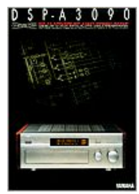
Catalog of that time

Don't you think? this, it is end of year sale of 95 years. If that, so you say, this series end of year sale we would like to see by all means, is, (laughing). We would like to put out more quickly, is usual demand from business, however it is, with circumstances of the design, becoming by any means the "New Year's present," the stripe bearing, the shank (laughing). Persevering, persevering, way somehow it can produce within year,! With, the cancer the \tau , finally December (laughing).