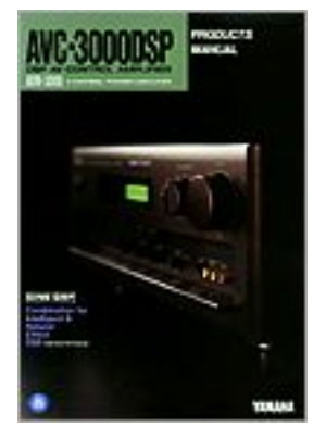
Catalog of that time

As for AVC-3000DSP in completely another design, various function is added, it is. The function and the like which such newly is added, was taken over to AVX-2200DSP, don't you think? it is.