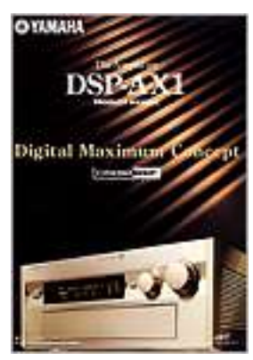
Catalog of that time

Because method of making the sound field which becomes the basis, it changes largely, it recreated also the sound making of cinema DSP entirely from one, don't you think? it is.